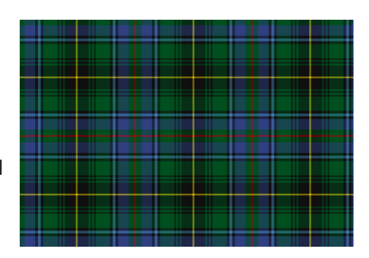
MacInnes Onich Tartan

This Scottish heritage national observance originated in Canada in the 1980s. Nova Scotia was the first to formally recognize April 6 in 1987, choosing that date because the Declaration of Arbroath was signed April 6, 1320 – the document sent by Scottish nobles to the Pope declaring Scotland's independence from England. Canada made April 6 official in December 1991.